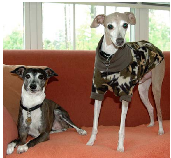
Sable & Oliver